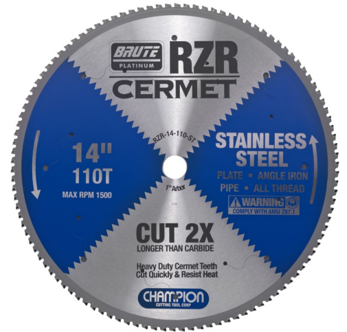
Low Speed Chop Saws