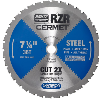
Corded Circular Saws